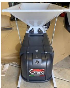
Hand Driven Destemmer