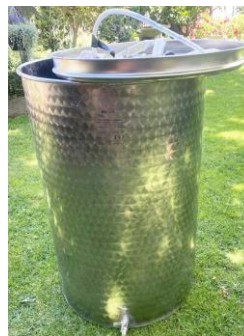
317 Litre Variable Capacity Tank