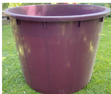
500L Fermenting Vat