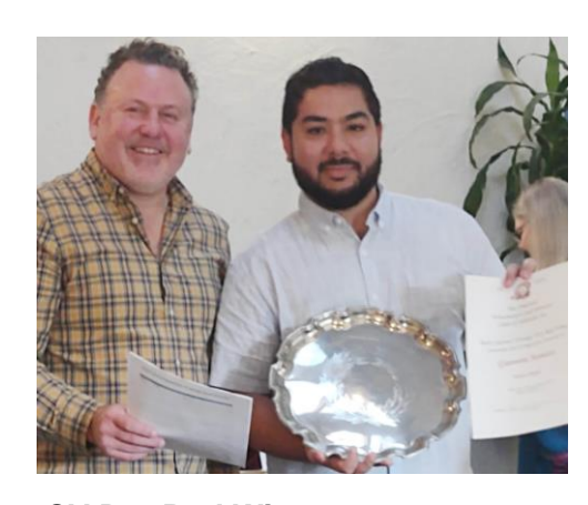
Best CV Dry Red Wine (President's Trophy)