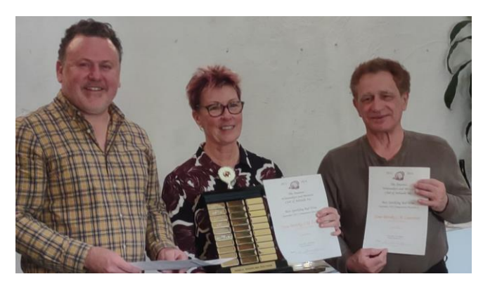
Sparkling Red Grape Wine ( AWBCA Sparkling Red Wine)

(M Lineage Syndicate with A. & R. Dyson)