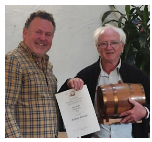
"Winemaker of the Year"