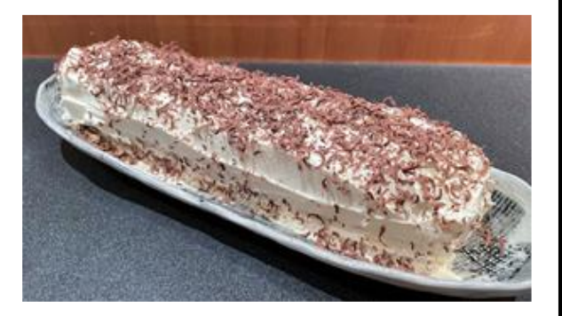
Provided by the members