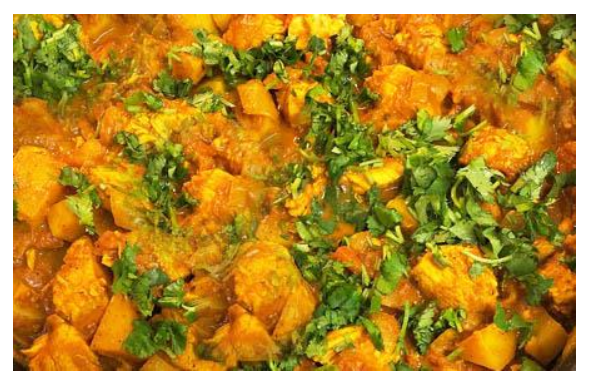
Prepared & organised by Domenic Facciarusso