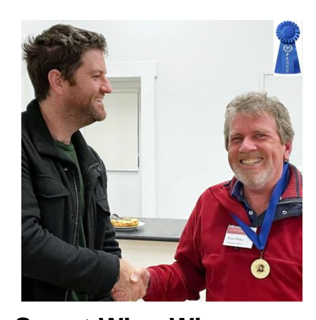
Sweet Wine Winner

Subscription of $30 remains unchanged given the healthy financial position the Club is in however, they are due now...please find a way to have them paid ASAP.