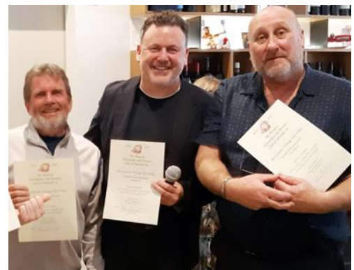
Best CV Dry White – Jordan Estate Syndicate