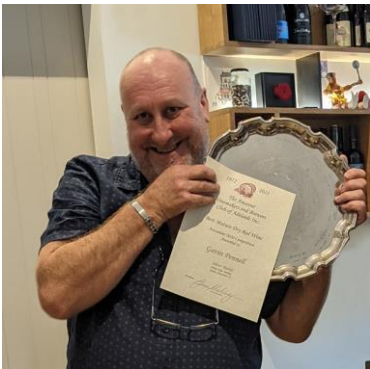
Best CV Dry Red Wine "John Samuel Trophy"