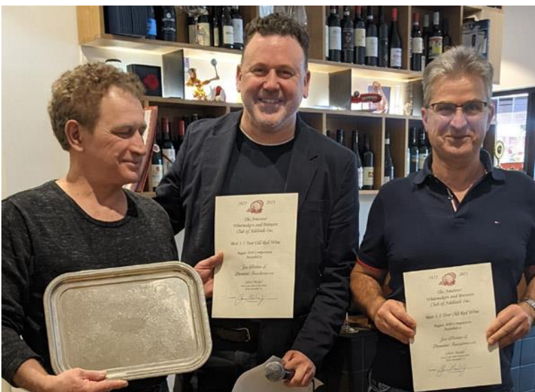
Best Mature Dry Red Wine 1-3-year-old "Glenn Snook Trophy"