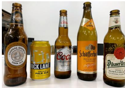
The Line up

Gavin provided a beer presentation, providing insight into how the particular beer is made, complete with characteristics, expectations and of course, a tasting- a crash course in beer style, mostly imported.