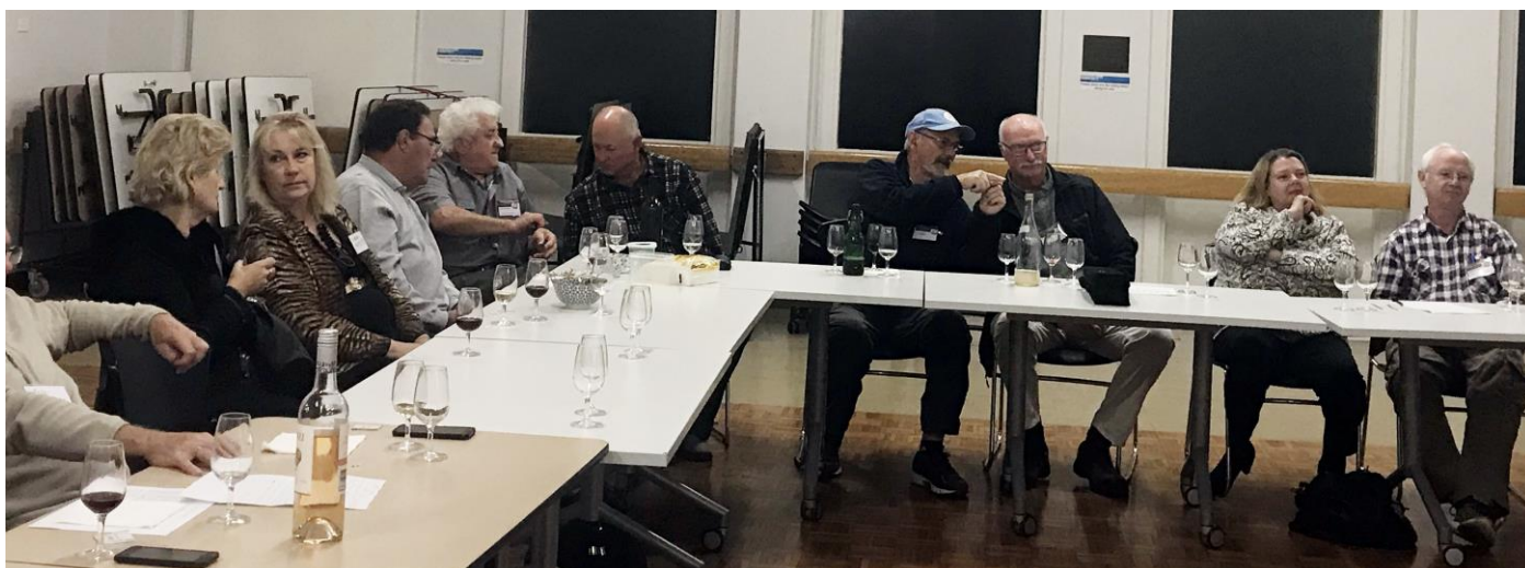
Members doing what they do best...