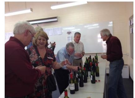
Some members at an ANAWBS tasting