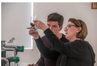
2 judges comparing wines